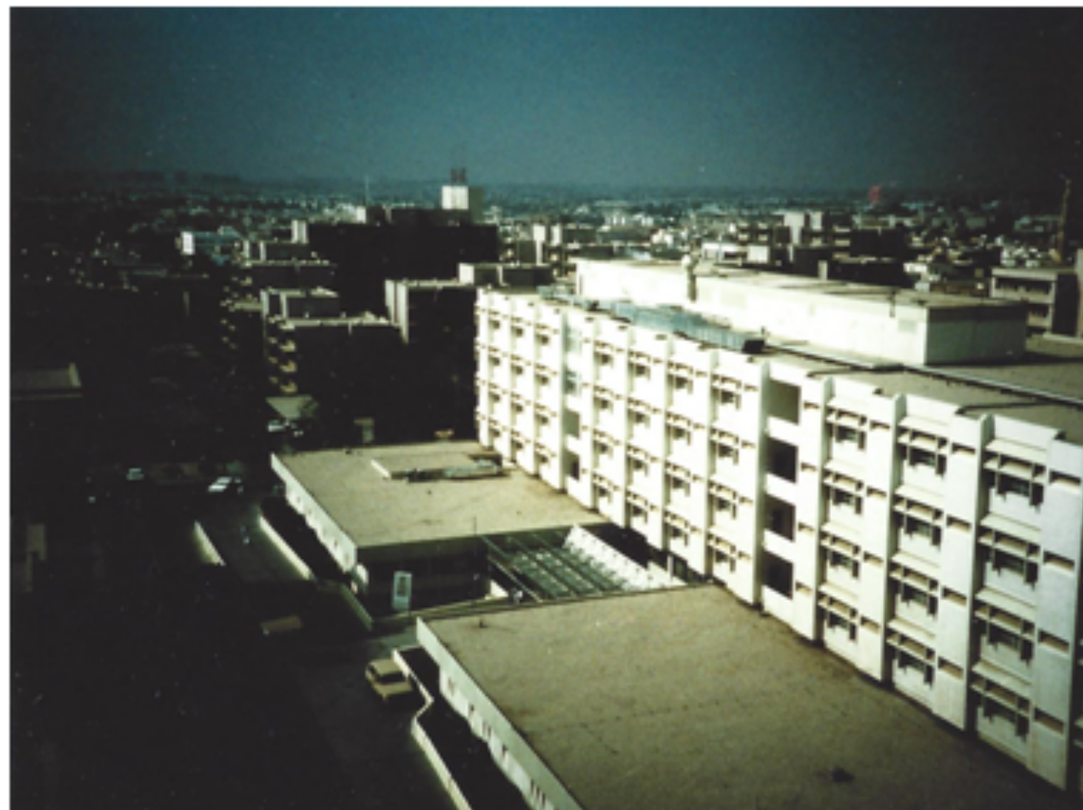
Echelon IV, Kharj 50 th General Hospital, Persian Gulf War, Riyadh Saudi Arabia