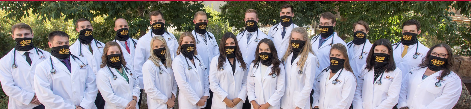
The E-20 class of University of Wyoming WWAMI medical students.